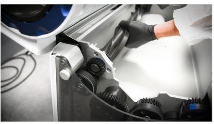
Start with the helical blades. One end has a gear, which fits to the gears on the side of the M108. Make sure the helical blades are seated properly at both sides.